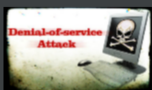
Distributed Denial of Service